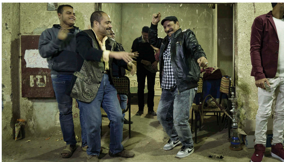
Photograph 3. Detail of a birth party that occupies the entire alley and animates the entire neighborhood in the so-called "informal" district of Bashtil, Cairo, Egypt, early evening, November 18, 2016