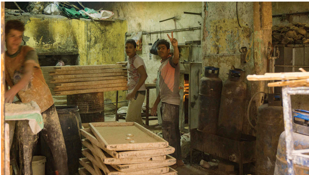
Photograph 2. Young baker's boys at work in a bakery open on a bustling street in the old working-class neighborhood of Bab al-Sha'iriya, Cairo, Egypt, mid-afternoon, November 28, 2016.

Our study results confirmed what we suspected, that “our Cairo informants have more pointed to sound as vehicle than described the sonorities: maybe the average Cairo citizen is much more a semiologist than an acoustician” (Battesti 2017, 150). This indicates that acoustic and social properties are inseparable (Photograph 2). To go beyond the