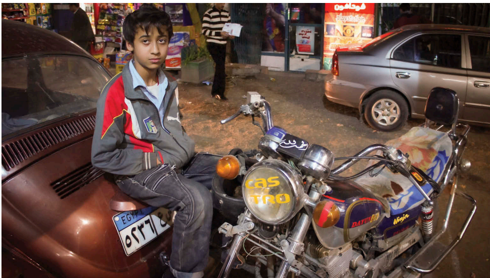
Photograph 4. In al-Helmiya, Cairo’s historic popular district; the narrowness of most of its alleys does not allow cars to circulate, Cairo, Egypt, on the night of March 31, 2011