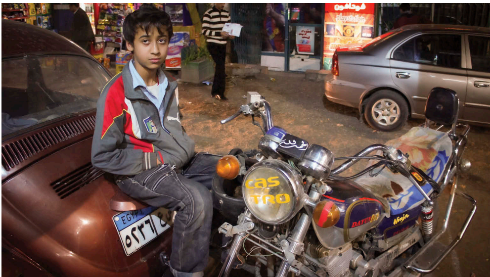
Photograph 4. In al-Helmiya, Cairo’s historic popular district; the narrowness of most of its alleys does not allow cars to circulate, Cairo, Egypt, on the night of March 31, 2011