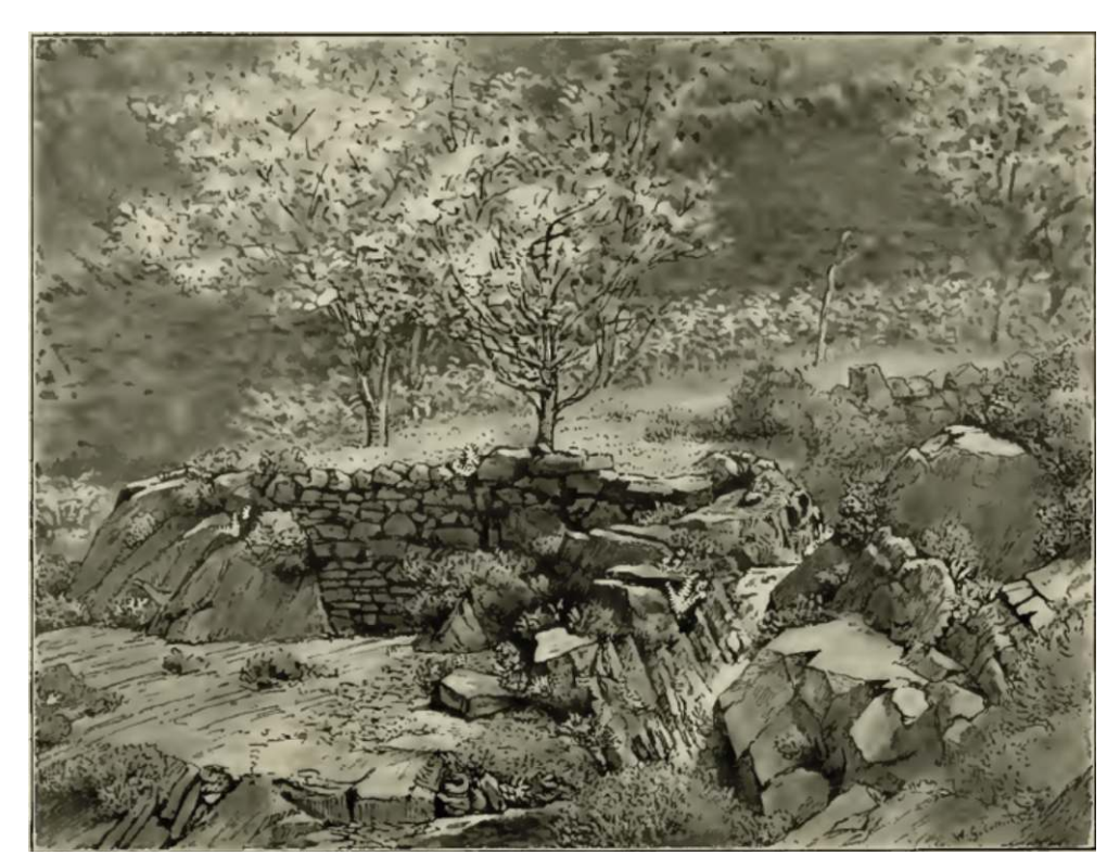
Figure 2. 'Ruskin's moorland garden'.

Illustration by COLLINGWOOD, William Gershom, from his Ruskin Relics, 1903, 41.