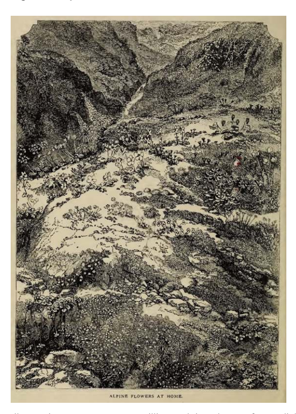
Illustration to ROBINSON, William, Alpine Flowers for English Gardens . London: Murray, 1870: facing title page, engraved from a drawing by DAWSON, Alfred.

In those new gardens, Robinson meant to encapsulate the beauty of the various landscapes he remembered from his trips in the mountains of Europe. Through his publishing activities, he invited and helped readers to recreate miniature ecosystems reminiscent of the natural scenes he had glimpsed in the wild, just as Ruskin managed to condense the scenic alpine landscape in his drawings.<sup>17</sup> As Robinson aptly put it: