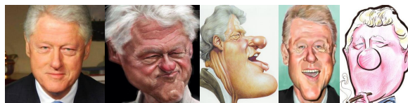
Figure 1. Realistic visual images and the caricatures of Bill Clinton. The different artistic styles result the large variation of the caricatures even with the same identity.

In the recent decade, the performance of face recognition [1], [2], [3] achieves or surpasses human being performance on the datasets such as LFW[4], YTF[5] etc. Rather than the methods based on the hand-craft features such as LBP, Gabor-LBP, HOG, SIFT [6], the deep learning based methods mitigate the problems, e.g. the occlusion, the variation of the pose, via the representation learning by leveraging the enormous data. Nonetheless, the challenge of face recognition still exists, for example, the non-rigid deformation and distortion as shown in the facial expression as well as in the caricatures. Unlike the realistic visual facial image, caricatures are the facial artistic drawings with the exaggerations to strengthen certain facial instinct features as shown in Figure 1. Due to the diverse artistic styles, the caricatures not only have great difference with the heterogeneous real visual images but also differ greatly within the caricatures. Either the intra-class or the inter-class variation of caricatures are much more distinct than the visual images [7], which is a big challenge comparing to the face recognition on the real visual images. Thus it is not plausible to employ a model trained for the real visual image to recognize the caricatures and vice versa. Rather