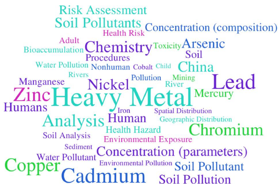
Figure 3. Word cloud of keywords used in the 167 articles from International Journal of Environmental Research and Public Health with the term “heavy metal” in the title (sourced from Scopus, data accessed on 10 October 2019).

In environmental science, the chemical speciation (molecular form) of the elements is often overlooked [15]. The fact that chemical speciation is rarely considered may be because it is relatively expensive (time and resources) and inherently difficult to measure directly. Sometimes, fractionation analysis is performed, such as sequential chemical extraction, to identify the accessibility of portions of the total sample content. However, elements are mostly judged as toxic because of evidence relating to the toxicity of only a few of the chemical species in which they occur, often from laboratory-based acute exposure. Since their physical, chemical and biological characteristics depend on molecular structure and not its elemental constituents, so does its toxicity. Indeed, the toxicity of these PTEs, like lead and cadmium, depends on their speciation and concentration not only in a quantitative way but also qualitatively. Bioaccessibility and/or bioavailability should be considered. Overall, human exposure to lead by the addition of tetraethyl-lead to gasoline as an antiknock agent, or to lead paint, is well documented. However, the lead-acid battery does not pose a direct threat to humans through use but may generate environmentally hazardous waste [16].