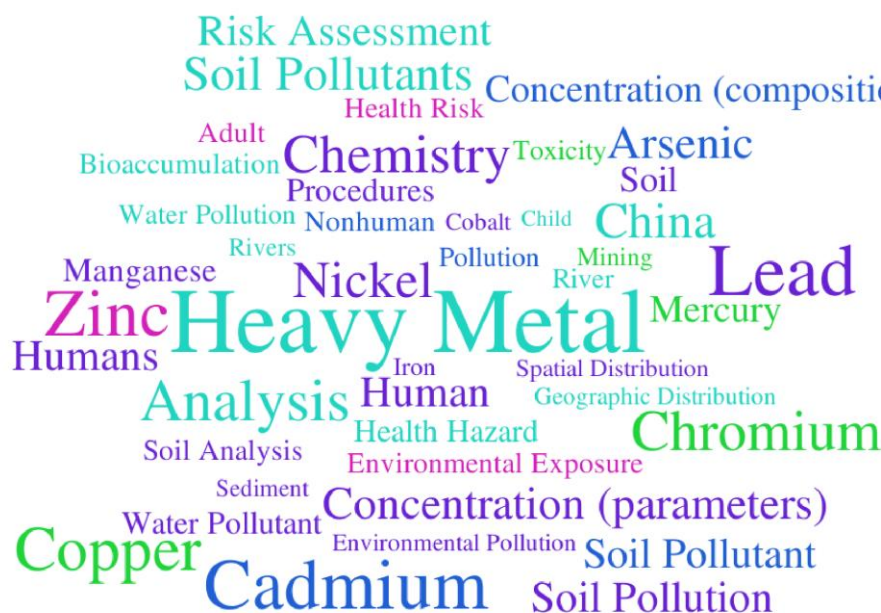
Figure 3. Word cloud of keywords used in the 167 articles from International Journal of Environmental Research and Public Health with the term “heavy metal” in the title (sourced from Scopus, data accessed on 10 October 2019).

In environmental science, the chemical speciation (molecular form) of the elements is often overlooked [15]. The fact that chemical speciation is rarely considered may be because it is relatively expensive (time and resources) and inherently difficult to measure directly. Sometimes, fractionation analysis is performed, such as sequential chemical extraction, to identify the accessibility of portions of the total sample content. However, elements are mostly judged as toxic because of evidence relating to the toxicity of only a few of the chemical species in which they occur, often from laboratory-based acute exposure. Since their physical, chemical and biological characteristics depend on molecular structure and not its elemental constituents, so does its toxicity. Indeed, the toxicity of these PTEs, like lead and cadmium, depends on their speciation and concentration not only in a quantitative way but also qualitatively. Bioaccessibility and/or bioavailability should be considered. Overall, human exposure to lead by the addition of tetraethyl-lead to gasoline as an antiknock agent, or to lead paint, is well documented. However, the lead-acid battery does not pose a direct threat to humans through use but may generate environmentally hazardous waste [16].