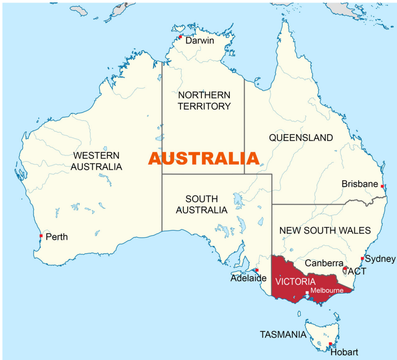
Figure 1. Victoria and Melbourne in Australia.

Most archaeologists and Cultural Heritage Advisors (CHAs) aimed for an improvement in the outcomes of archaeology and hoped for a fruitful relation with Aboriginal communities. However, the definition by my interviewees of a ‘good archaeological outcome’ varied widely, covering a large spectrum of objectives that included: doing an ethical and fulfilling job, doing research as a source of pride, protecting Aboriginal heritage for future generations, collaborating with modern Aboriginal communities, understanding landscape dynamics, recording human occupation history, producing solid scientific data, clearing land for development and simply making a decent living. All these goals were singularly defined as good or good enough by each individual. Furthermore, a few actors in the CHM sector whom I spoke to were Aboriginal and presented an agenda not that far removed from the archaeologists’ preoccupations that were focused on improving socio-economic conditions for Aboriginal people, defining new sources of income, and gaining knowledge, empowerment, rebuilding pride and obtaining a higher status for their own specific Aboriginal community.