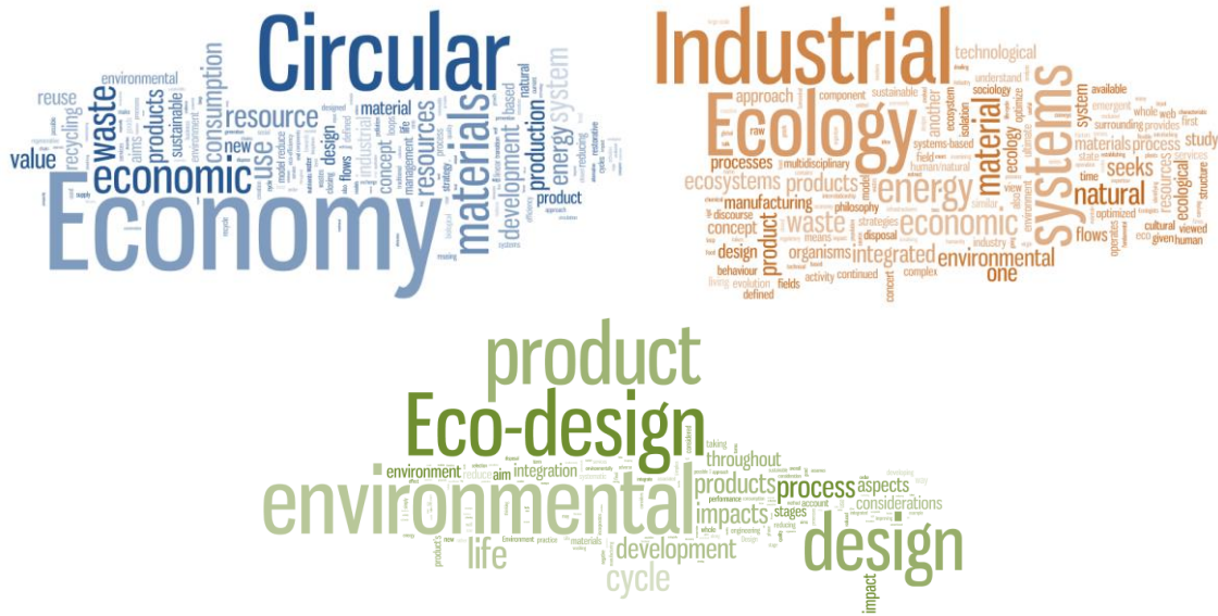
Figure 3. Word clouds of circular economy, industrial ecology and ecodesign definitions

What is novel and exciting for the CE relies on the traction it gained relatively rapidly – compared to the IE, which barely had a couple of mentions in industrial press releases back in the 1990s or 2000s (Bocken et al., 2017) – among businesses, industrial practitioners, and policy-making communities (Blomsma and Brennan, 2017; Korhonen et al., 2018a). Yet, even if an increasing number of firms (e.g., Caterpillar, Renault, or Unilever) are setting and communicating on CE strategies and associated targets implementing in their operational practices, there is still a long way to go for widespread adoption of CE- or IE-centered mindset in many businesses or industrial sectors (Bocken et al., 2017; Masi et al., 2017). In fact, although lot of ecodesign tools are available, their implementation in practice still requires some efforts (Mathieux et al., 2020).