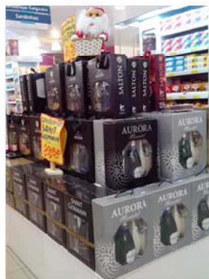
Figure 2. Supermarket shelf in Brazil. Source: [47].

In Brazil, the production of sparkling wine began in 1913, by Manoel Peterlongo. The production was increased with the arrival of multinational companies in the 60's [21]. Over the years, sparkling wine has gained visibility and varied forms of production. According to Brazilian law, there are two types of sparkling wines, sparkling wine ( vinho espumante , in Portuguese), "champagne" or natural sparkling wine, and the sparkling wine muscatel. The difference is mainly due to the method of elaboration. As for the former, carbon dioxide comes