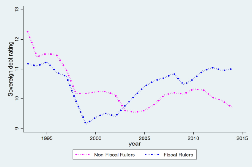
Figure 3 : Changes in debt rating for FR and Non-FR groups (1993-2014)