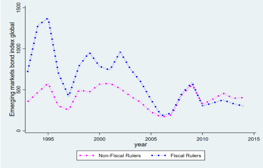
Figure 2 : Changes in bond spreads for FR and Non-FR groups (1993-2014)

Tables A1, A2, and A3 in the appendix summarize the different variables used in this paper and lists all the countries studied.