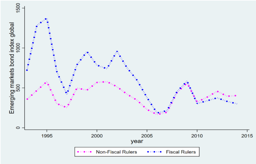
Figure 2 : Changes in bond spreads for FR and Non-FR groups (1993-2014)

Tables A1, A2, and A3 in the appendix summarize the different variables used in this paper and lists all the countries studied.