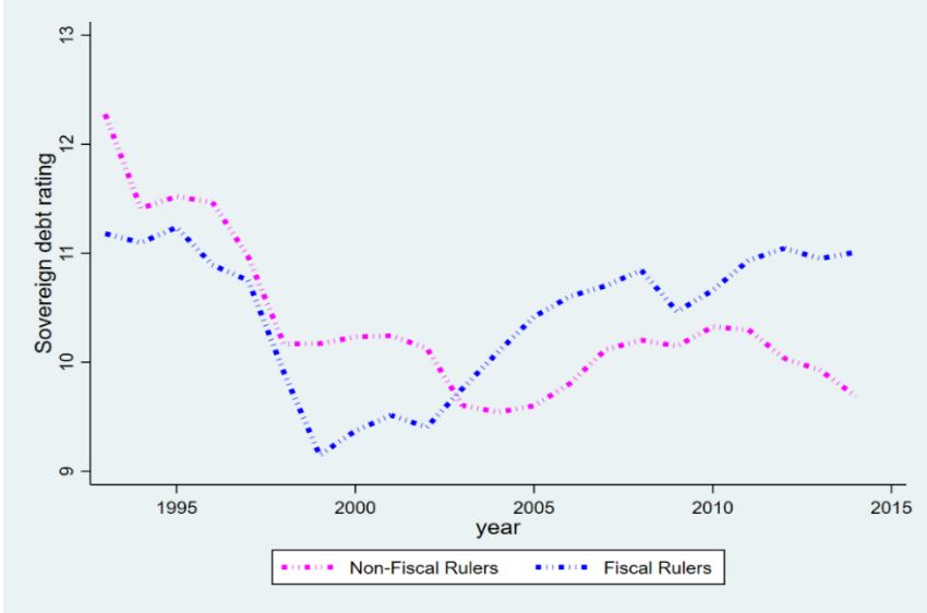
Figure 3 : Changes in debt rating for FR and Non-FR groups (1993-2014)