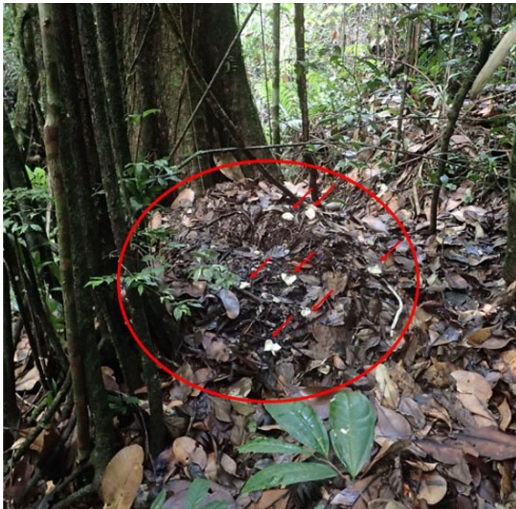
Figure 1. Nest of Paleosuchus trigonatus in the Nouragues natural reserve, French Guiana (4.0667°N, 52.6833°W; Datum WGS84; 20 m elevation). Position indicated by the red circle. Arrows indicate remains of the eggshells.

On the 16 th of November 2017, five meters from the bank where the neonates had been discovered, the remnant eggshells of a recent nest were found. We believe that nest to be the neonates' origin. It was made out of dead vegetation and measured about 140 cm of diameter and nearly 60 cm of height (measured with a tape to the nearest centimetre) and was located adjacent to a big tree (Figure 1). One eggshell was found nearly intact measuring 67.1 mm of length and 41.2 mm of diameter (measured with a calliper to the nearest 0.1 millimetre).