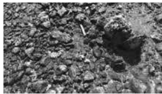
Close-up on gravel in asphalt coating, G. Meulemans

Today, asphalt is mostly used in combination to gravel and crushed stone to produce tarmac, the material most commonly used for building roads and many other urban hard surfaces in western countries. The properties of this mix were discovered by serendipity in 1849 by Merian, a Swiss engineer at the asphalt mine of Val de Travers. Merian noticed that small quantities of asphalt often fell from transport carts on the road between the mine and the village and was then compressed under the wheels of the carts. He observed the strength and elasticity of the surfacing thus formed, and in 1854, the first compressed asphalt road was constructed in Paris following Merian's marketing of the process (Abraham, 1918).