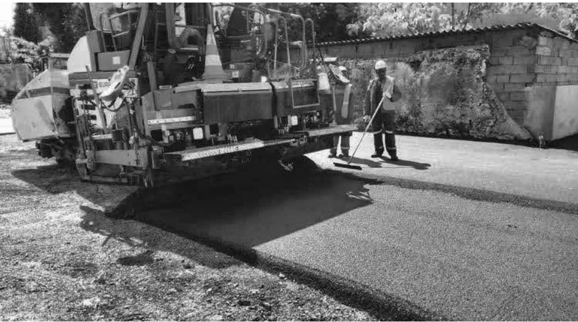
Surfacing with a smooth dark finish, G.Meulemans

Few people think of how the roads they ride on are made. Today, tarmac is manufactured in asphalt mix plants. It is then transported in heat-proof trucks and set in place at the temperature of 150° C using machines called 'finishers' that can spread in the desired thickness of layers. The tarmac layer is laid on a compacted base course made of several other layers. It rests on a subbase of coarse sand bound with cement, which spreads the load evenly over a subgrade made of compacted native material. It then has to be compacted again before cooling by a repeated passage of rollers. To road workers, working with asphalt is hard and dangerous. Depending on its chemical composition and the temperature conditions, asphalt demonstrates a complex range of behaviours that oscillate between viscosity and elasticity. To be workable, the material must be at a mid-point between grain and liquid. Working with hot tarmac is to be amid a scene replete with the smouldering mouth of a truck's tipping trailer, and of helmeted workers sweating around the furnace, in