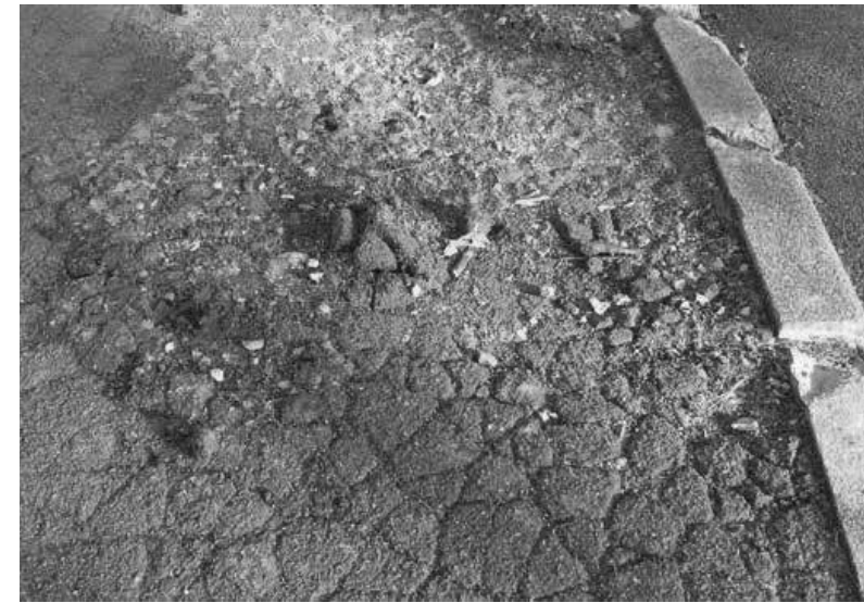
Anthropogenic parent rock, G.Meulemans

a sea of machine noise and warning horns. An intense heat emanates from the sticky ground just laid, irradiating through shoe soles. The compaction of the roller allows workers to get rid of all the air and water. There lies another ambiguous aspect of asphalt: it is used to waterproof city soils, but fears water and rain when hot. Once cold, tarmac is only rock and solid glue, it becomes a closed up material without any voids. Pitched against the utmost vitality of water, which takes particles away and invites life everywhere it flows, engineers have chosen asphalt and its millenary history of waterproofing and stabilising to coat road gravel. A layer of asphalt coated gravel is one into which no mole or worms will dig a burrow, in which no rainwater will soothe, no fungi or bacterial colony will develop. As in the coating of ancient mummies, asphalt suspends the work of life.