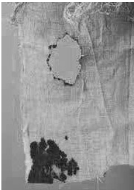
Egyptian mummy band stained with asphalt

Asphalt is the residual fraction obtained by the distillation of crude oil. This means that it is oil's heaviest fraction, and the one with the highest boiling point. Asphalt is in itself a fold of the organic and mineral worlds, as its origin rests in organisms that were living in the Cambrian and Tertiary periods. However, its origin in thriving life is easily forgotten as it serves to counter life too. Be it in the form of tarmac when combined with gravel, or in the coating of Egyptian mummies, it has been used across millennia to set things outside of the ongoing forces of weathering, decay, decomposition and disaggregation.