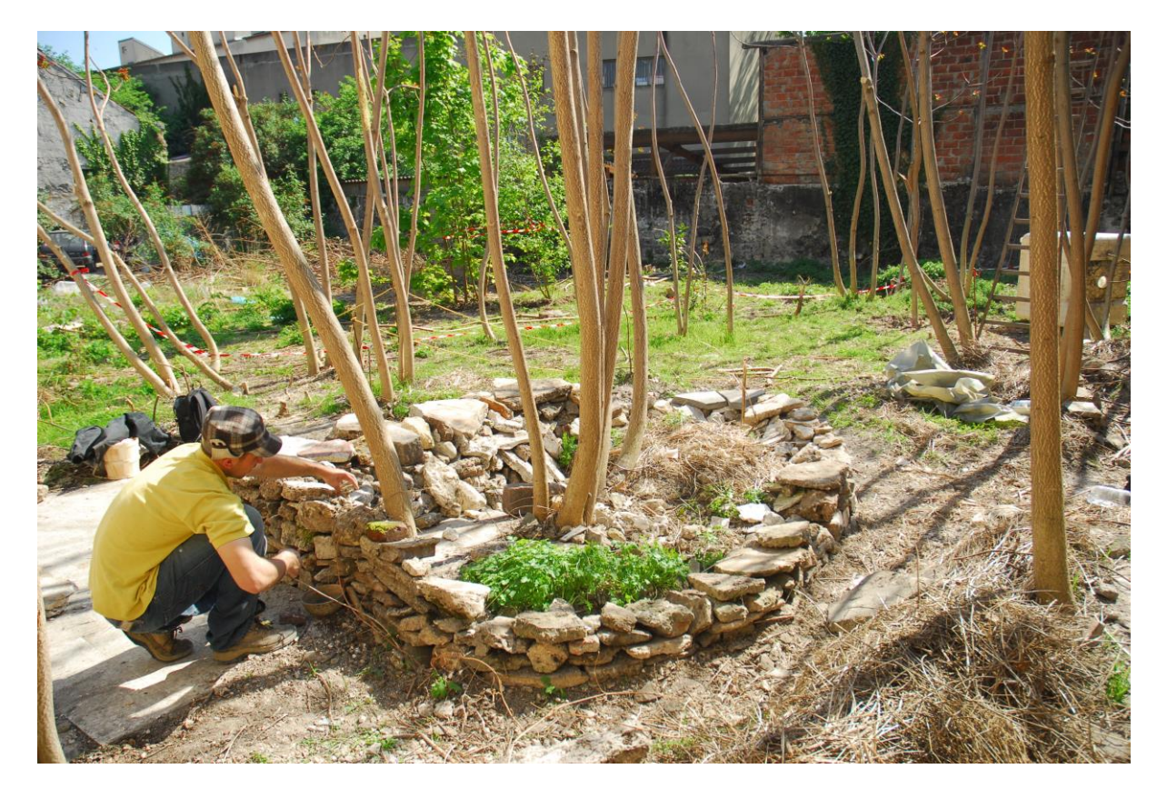
Figure 10.3: Léonard Nguyen Van Thé builds a dry-stone wall around a tree of heaven ( Ailanthus altissima ) on a brownfield site in Aubervilliers. The pit will later be filled with vegetable waste and dry leaves to make a bateau—a walled lasagna.

Dry-stone wall constructions are in fact an apt metaphor for thinking about anthropogenic pedogenesis, in which soil, plants, and human activity co-constitute each other in the making process. Indeed, on mountain slopes, the shape that a wall takes is organic; the tree and the weather are as responsible for it as is the human builder. It emerges not from planning but in the repetition of the building and rebuilding process, in the constant struggle with the forces of rain, wind, and gravity. As the philosopher and dry-stone mason Jean-Baptiste Vidalou explains, the dry-stone walls that pepper rural landscapes in southern France and Europe have nothing in common with what we call infrastructure, because they do not flatten the territory or participate in dreams of control. They have not been "designed following a pre-established