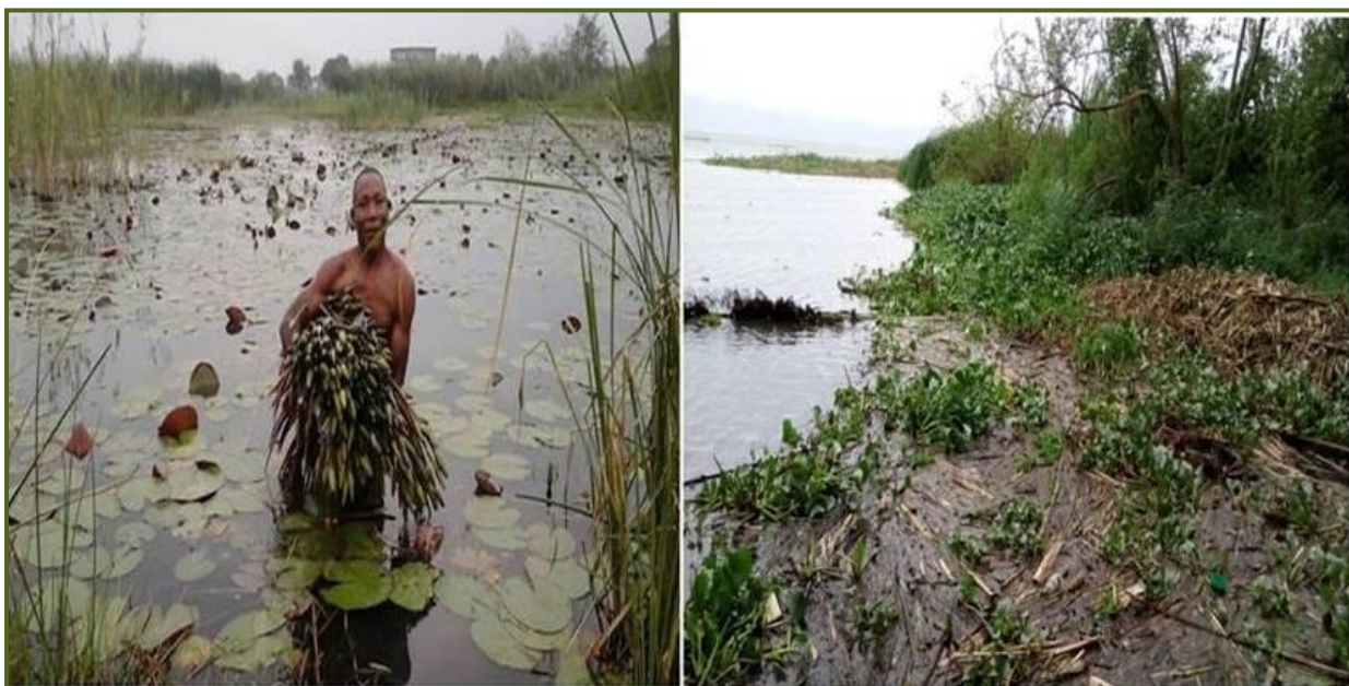
Figure 5: Proliferation of Eichhornia crassipes along Lake Tanganyika shores, nearby Bujumbura port