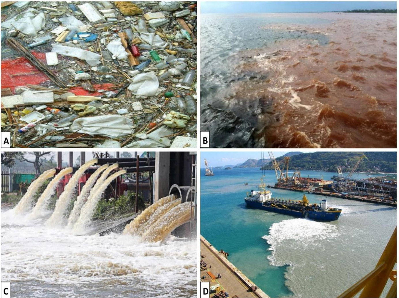
Figure 2: Different types of pollution of Lake Tanganyika: Point-Source of domestic pollution (A), Sedimentary pollution owing to rainy erosion (B), Urban wastewater pollution (C) and Industrial pollution (D).