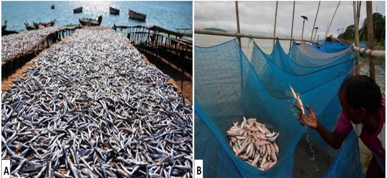
Figure 3: Overfishing (A) and use of destructive gears (B) in Lake Tanganyika.

the commercial catches and the majority of the fish caught are juveniles. The figure 3 shows the Overfishing and use of destructive gears in Lake Tanganyika.