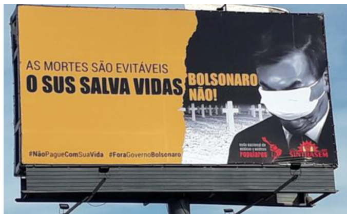
Figure 3: Outdoor Propaganda

Figure 3 shows an outdoor propaganda in the city of Florianópolis, Brazil, stating: “The deaths are preventable. SUS saves lives. Bolsonaro doesn’t!”. Indeed, as discussed in this brief paper, the lack of concrete health policies in Brazil, led by the authoritarian government of Jair