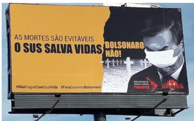
Figure 3: Outdoor Propaganda

Figure 3 shows an outdoor propaganda in the city of 170 Florianópolis, Brazil, stating: “The deaths are preventable.” 210