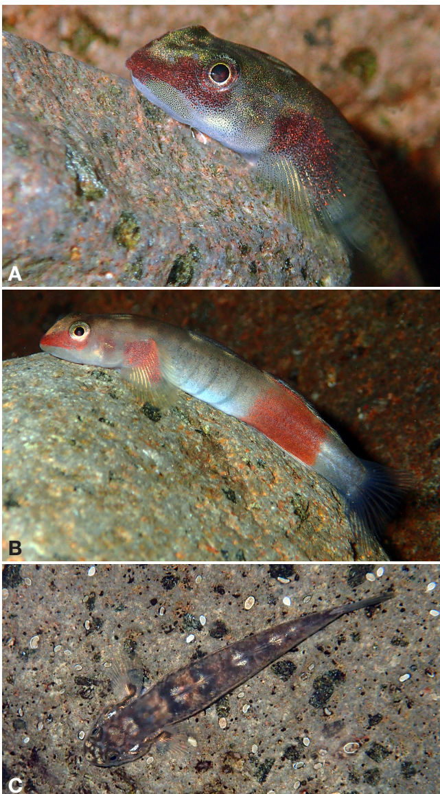
Figure 1. - Lentipes kolobangara . A: Male; B: Male; C: Female. A, C: photos C. Lord; B: photo P. Keith.

Lentipes multiradiatus Allen, 2001. – WAM 32370.003, 1 male, 3 females (30.0-37.0 mm SL); Papua New Guinea, Awaetowa River, D'Entrecasteaux Islands, Fergusson Island,