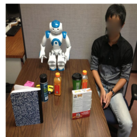
A: The green cup is called Bill. B: Ok, the green cup is Bill. [point to the inferred object] (Liu and Chai, 2015)

Figure 1: Examples of the generation and interpretation of grounded referring expressions in multimodal interactive settings. Grounding is making sure that the listener understands what the speaker said.