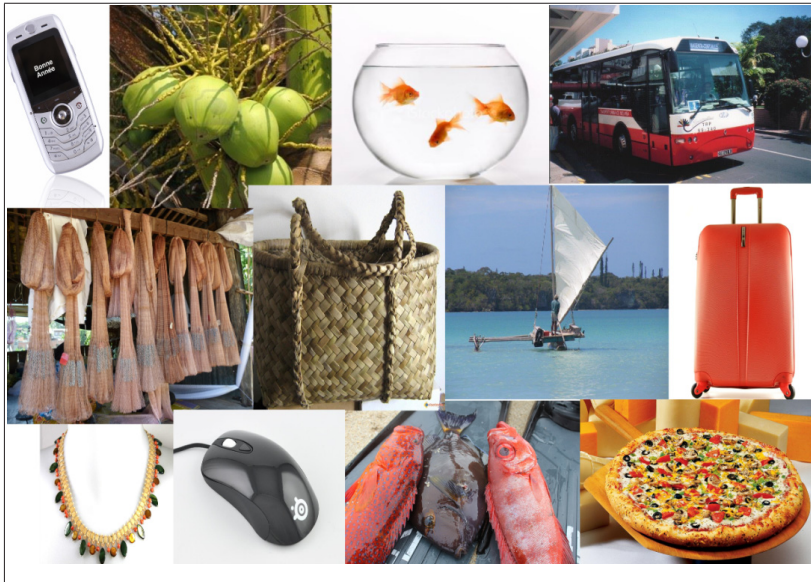
FIGURE 2. EXAMPLES OF STIMULI MAKING UP THE ELICITATION KIT†

The protocol for conducting the test involved creating conditions of use for possessive classifiers in speech that was as natural as possible. For this purpose, speakers were asked to produce, for each card, a complete sentence naming both the object represented and the person to whom it supposedly belonged. Those supposed possessors, organized in a ran-