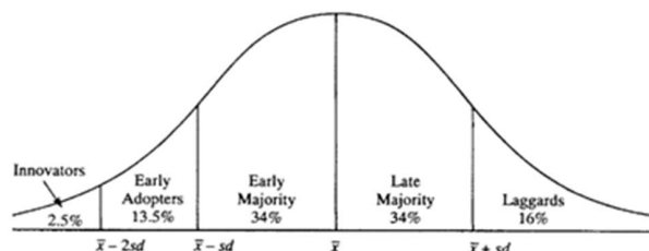
Fig. 1. Different categories of solution adopters over time [4]

Therefore, the following research question is proposed for this paper: “What are the characteristics of the first 50 % of water reservoir pump operators to adopt implicit demand response?” To address the research question, this paper designs a simulation model to investigate the characteristics of the first 50 % of a population of water reservoir pump operators who adopt IDR according to the theory of diffusion of innovation [4] (shown in Fig. 1).