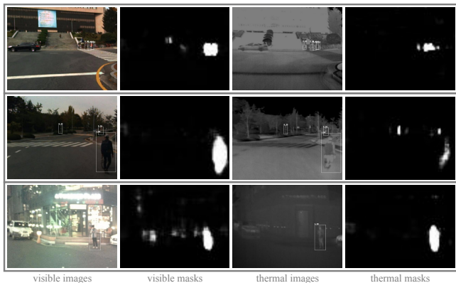
Fig. 1. Examples of thermal and RGB images of the same aligned scenes taken from KAIST multispectral pedestrian detection dataset [1] with detected bounding boxes. The segmentation masks (2nd and 4th columns) are predicted based on the (mono-)spectral features before any fusion process.

Visible and thermal image channels are expected to be complementary when used for object detection in the same outdoor scenes. In particular, visible images tend to provide color and texture details while thermal images are sensitive to objects' temperature, which may be very helpful at night time. However, because they provide a very different view of the same scene, the features extracted from different image spectra may be inconsistent and lead to a difficult, uncertain and error-prone fusion as shown in Figure 1. In this figure, we use a Convolutional Neural Network (CNN, detailed later) to predict two segmentation masks based on the two (aligned) mono-spectral extracted features from the same image and then fuse the features to detect pedestrians in the dataset. During the training phase, the object detection and the semantic segmentation losses are jointly optimised (the segmentation ground truths are generated according to pedestrian bounding box annotations). We can observe that most pedestrians are visible either on the RGB or on the infrared segmentation masks which illustrates the complementary of the channels. However, even though the visible-thermal image pairs are well aligned, the similarity between the two predicted seg-