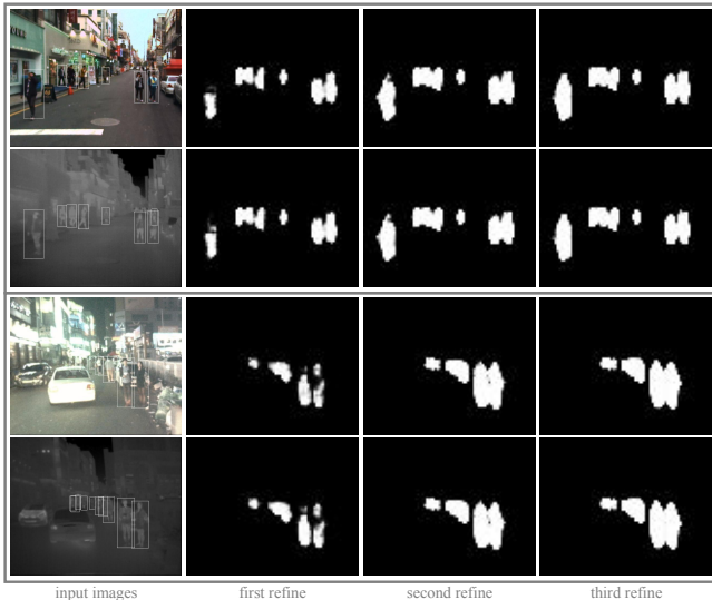
Fig. 4. Examples of pedestrian segmentation masks predicted on 2 visible/thermal image pairs (one taken at day time, one taken at night) of the KAIST dataset after a different number of loops (1-3) in the fuse-and-refine cycle. Zoom in to see details.