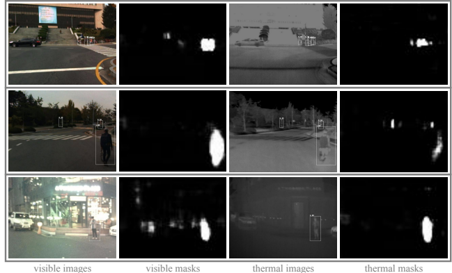
Fig. 1. Examples of thermal and RGB images of the same aligned scenes taken from KAIST multispectral pedestrian detection dataset [1] with detected bounding boxes. The segmentation masks (2nd and 4th columns) are predicted based on the (mono-)spectral features before any fusion process.

Visible and thermal image channels are expected to be complementary when used for object detection in the same outdoor scenes. In particular, visible images tend to provide color and texture details while thermal images are sensitive to objects' temperature, which may be very helpful at night time. However, because they provide a very different view of the same scene, the features extracted from different image spectra may be inconsistent and lead to a difficult, uncertain and error-prone fusion as shown in Figure 1. In this figure, we use a Convolutional Neural Network (CNN, detailed later) to predict two segmentation masks based on the two (aligned) mono-spectral extracted features from the same image and then fuse the features to detect pedestrians in the dataset. During the training phase, the object detection and the semantic segmentation losses are jointly optimised (the segmentation ground truths are generated according to pedestrian bounding box annotations). We can observe that most pedestrians are visible either on the RGB or on the infrared segmentation masks which illustrates the complementary of the channels. However, even though the visible-thermal image pairs are well aligned, the similarity between the two predicted seg-