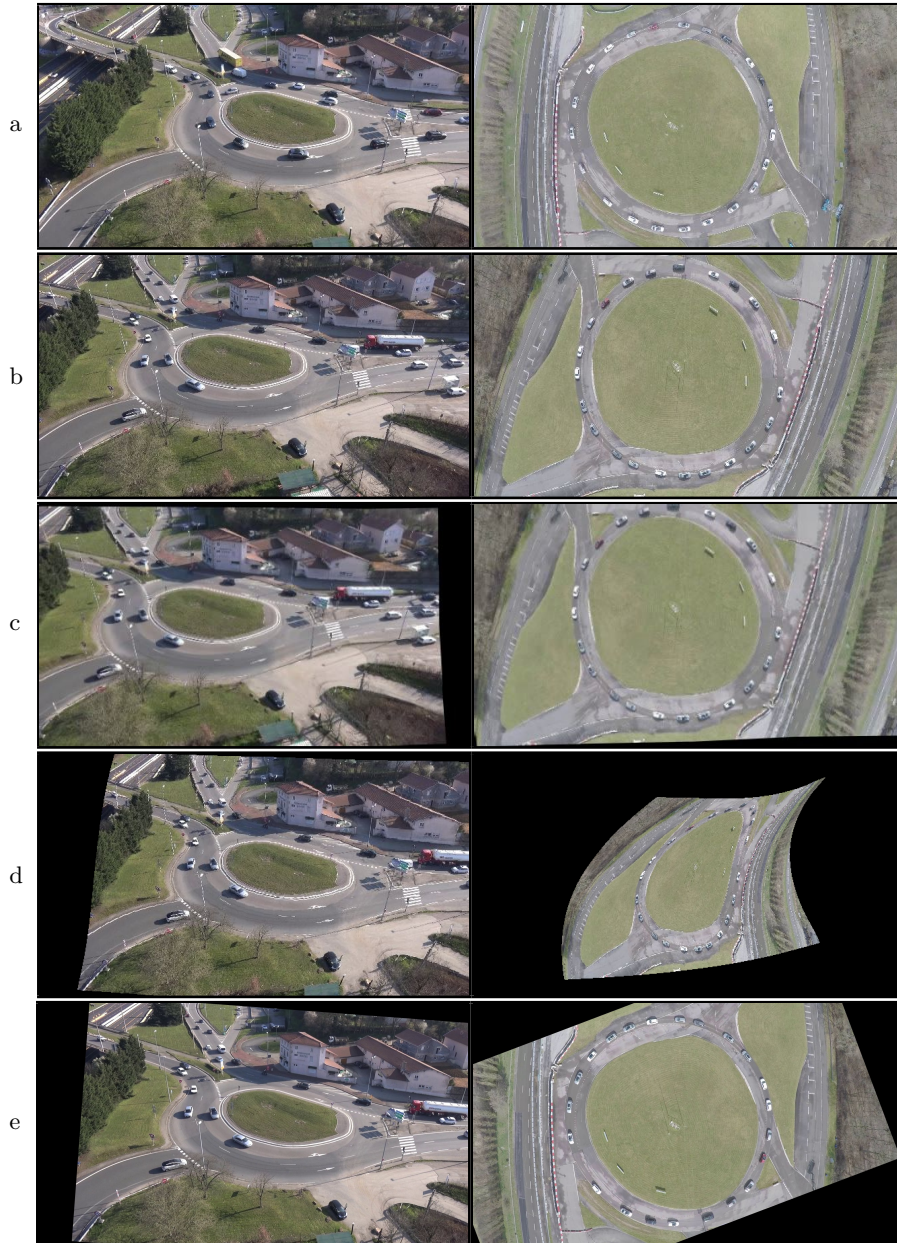
Fig. 1. Images extracted from the M4 (left column) and the C2 (right column) sequences in our database. a: first frame, used as a reference image. b: current frame, after approx. 15 seconds (resp. 45 seconds) on left M4 (resp. C2), which we want to register to the first frame of the sequence. c: the output of StabNet [16]. d: the output of CNN-Registration [18]. e: the output of the proposed method.