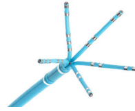
Fig. 1: PentaRay multi-spline catheter (BioSense Webster Inc).

Data are acquired at the Cardiology Department of Nice University Hospital Center (CHU). Data acquisition consists