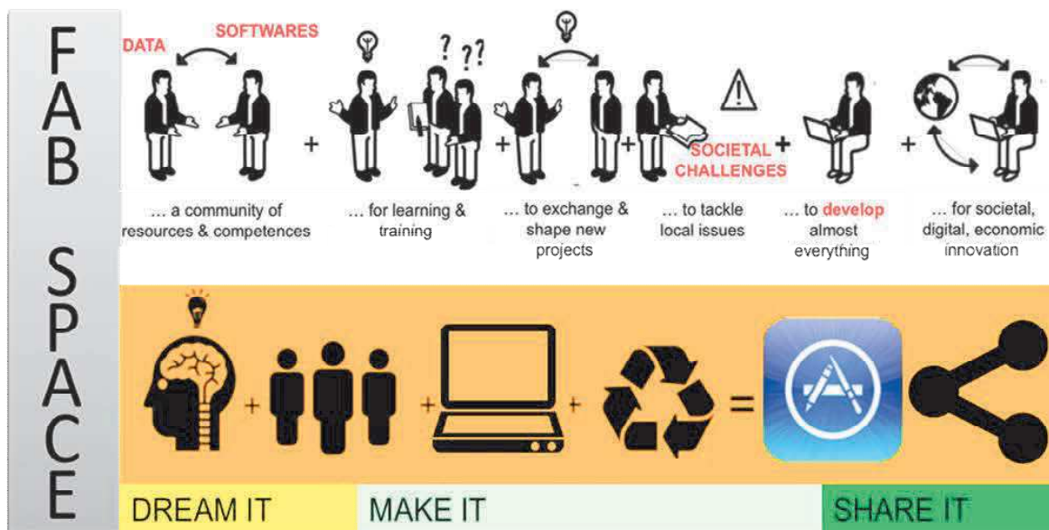
Fig. 2: The Fabspace model