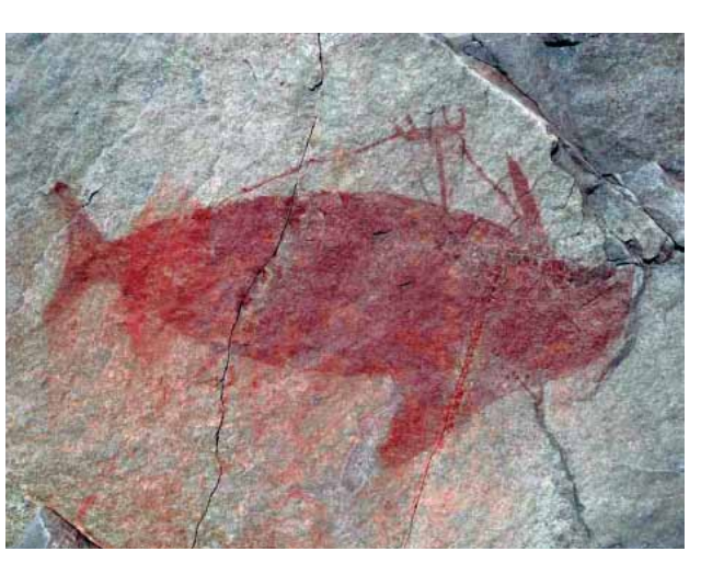
ABOVE An example of a hunting scene from the El Médano ravine. Note the size of the marine creature (49cm long in the original) in comparison to the tiny craft.

One of the most complex and frequently recurring themes is the hunt. Again and again we find images of tiny craft,