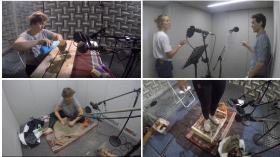
Figure 1. Foley and voice recording sessions: pouring tea, studio dialog, horse trot in the sand, and steps in the forest.

The jazz quartet musical extract came from the AVAD-VR 4 anechoic audio-visual database [1], also recorded at Sorbonne University.