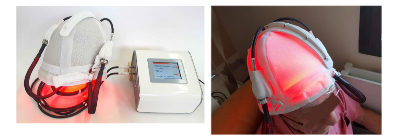
Figure 3 : The fabric-based illumination device used for P-PDT: red light is emitted by an optical fibre-based fabric that lines the inside of a cap held in place by an ergonomic helmet.

Developed within the Phosistos project funded by the European Commission (Project identifier: CIP-ICT-PSP-2013-7-621103) (http://www.phosistos.com/), P-PDT uses a 30-minute incubation with MAL cream under transparent occlusive dressing followed by 2.5 h of irradiation with a fabric-based biophotonic device without removing the dressing. As illustrated in Figure 1, this device consists of a power control unit including two 635 nm laser diodes with output power of 1 W each (Modulight, Tampere, Finland) and distributing red light at low-irradiance (1.3 mW/cm<sup>2</sup>) to a light-emitting fabric that lines the inside of a cap (Texinov, Saint-Didier-de-la-Tour, France) (Figure 1). Made from bent optical fibres, this fabric is biocompatible, flexible and provides a homogeneous irradiation over a 21 cm × 18 cm surface (378 cm<sup>2</sup>). Furthermore, an ergonomic helmet enables to keep the cap in place during the treatment. The device, classified as exempt risk group according to IEC 60601-2-57/2012, is configured to automatically start irradiation 30 minutes after it is turned on and stop it 2.5 hours later such that a total dose of approximately 12 J/cm<sup>2</sup> is delivered.