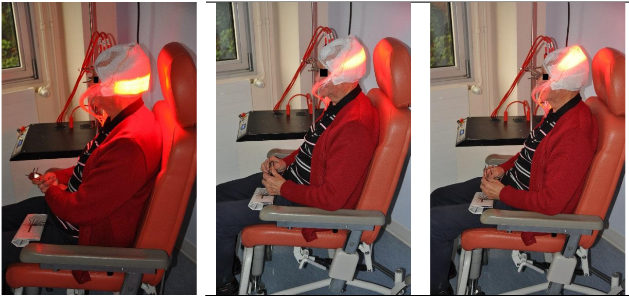
Figure 2: The three flexible light-emitting optical-fibre based fabrics involved in FLEXI-PDT sequentially emit 635 nm red light for one-minute resulting in a fractionated irradiation (1-minute light, 2 minutes' dark).

The FLEXITHERALIGHT protocol, developed within the FLEXITERALIGHT project supported by the French National Research Agency (ANR) (Projet-ANR-12-EMMA-0018) (http://www.flexitheralight.com/), involves a 30-minute incubation with MAL followed by a 2.5 h irradiation with a light-emitting fabric-based device. Due to the short incubation time, the FLEXITHERALIGHT protocol (FLEXI-PDT) should provide a nearly pain-free, all year round alternative to C-PDT. Moreover, the high flexibility of the light-emitting fabric-based device ensures an optimal conformation of the device to the area to be treated, offering clear advantages over other protocols.