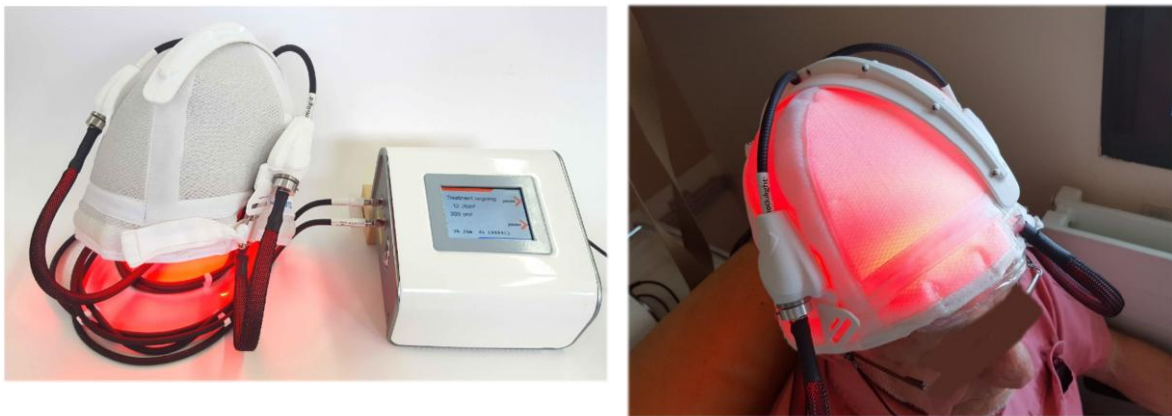
Figure 3: The fabric-based illumination device used for P-PDT: red light is emitted by an optical fibre-based fabric that lines the inside of a cap held in place by an ergonomic helmet.

Developed within the Phosistos project funded by the European Commission (Project identifier: CIP-ICT-PSP-2013-7-621103) ( http://www.phosistos.com/ ), P-PDT uses a 30-minute incubation with MAL cream under transparent occlusive dressing followed by 2.5 h of irradiation with a fabric-based biophotonic device without removing the dressing. As illustrated in Figure 1, this device consists of a power control unit including two 635 nm laser diodes with output power of 1 W each (Modulight, Tampere, Finland) and distributing red light at low-irradiance ( 1.3 \text{ mW/cm}^2 ) to a light-emitting fabric that lines the inside of a cap (Texinov, Saint-Didier-de-la-Tour, France) (Figure 1). Made from bent optical fibres, this fabric is biocompatible, flexible and provides a homogeneous irradiation over a 21 \text{ cm} \times 18 \text{ cm} surface ( 378 \text{ cm}^2 ). Furthermore, an ergonomic helmet enables to keep the cap in place during the treatment. The device, classified as exempt risk group according to IEC 60601-2-57/2012, is configured to automatically start irradiation 30 minutes after it is turned on and stop it 2.5 hours later such that a total dose of approximately 12 \text{ J/cm}^2 is delivered.