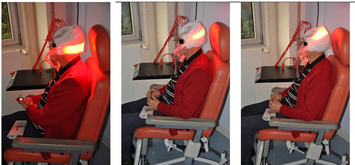
Figure 2: The three flexible light-emitting optical-fibre based fabrics involved in FLEXI-PDT sequentially emit 635 nm red light for one-minute resulting in a fractionated irradiation (1-minute light, 2 minutes' dark).

The FLEXITHERALIGHT protocol, developed within the FLEXITHERALIGHT project supported by the French National Research Agency (ANR) (Projet-ANR-12-EMMA-0018) ( http://www.flexitheralight.com/ ), involves a 30-minute incubation with MAL followed by a 2.5 h irradiation with a light-emitting fabric-based device. Due to the short incubation time, the FLEXITHERALIGHT protocol (FLEXI-PDT) should provide a nearly pain-free, all year round alternative to C-PDT. Moreover, the high flexibility of the light-emitting fabric-based device ensures an optimal conformation of the device to the area to be treated, offering clear advantages over other protocols.