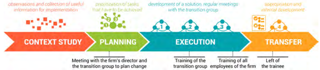
Figure 4 Conduct of the experiment for case 3: main milestones and important events.

dent who worked in the firm was hired, to retain acquired skills within the company. A second young architect competent on these issues have been hired since.