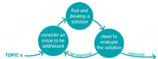
Figure 5 Process of development improvement and validation of solutions during the execution phase

Execution. The trainee worked on the transcription of this library and graphic charter on the new tool. During this phase, the transition group has been consulted very regularly (fig. 4, 5).