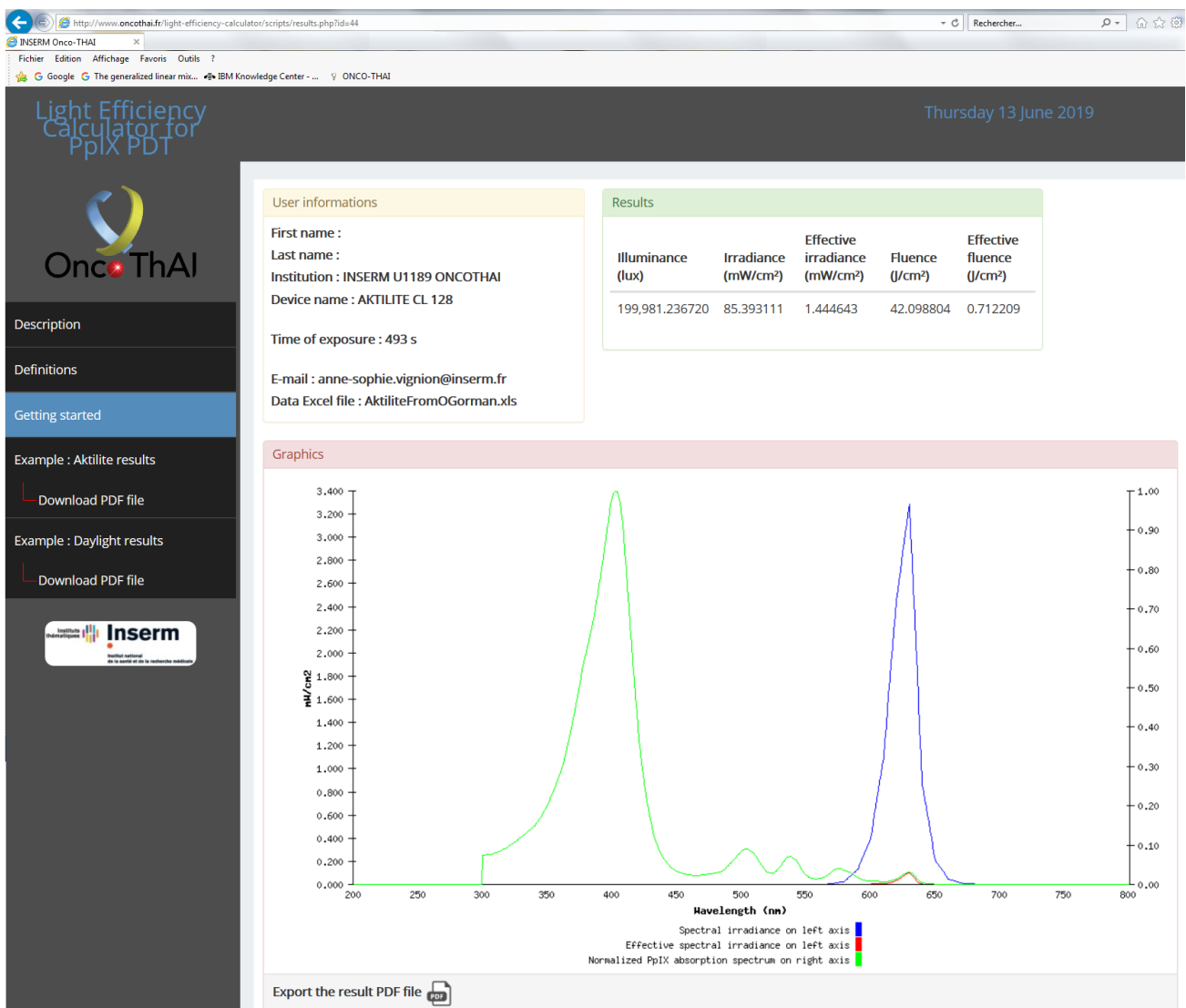
Figure 1. Example of results obtained with the freely available “Light Efficiency Calculator for PpIX PDT” website.