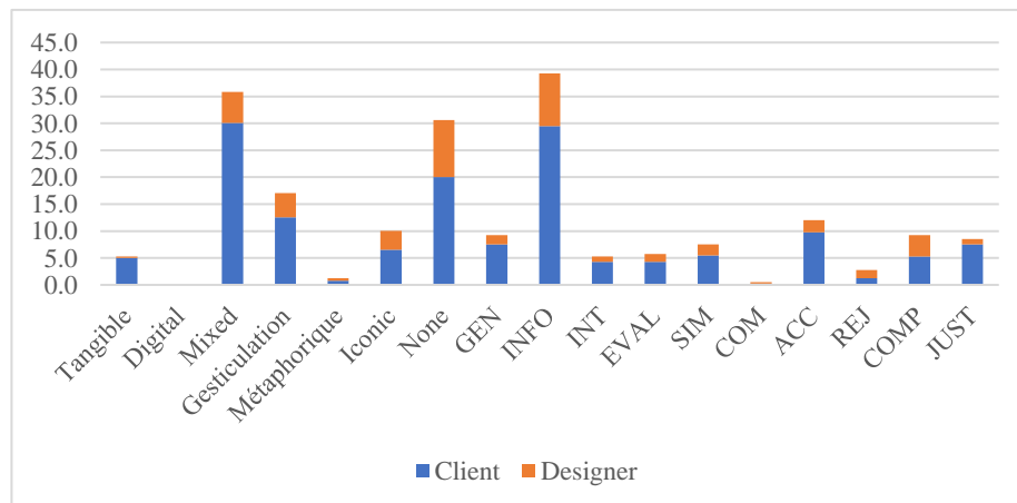
Figure 3. Interaction rate between Clients and Designers in the SAR condition

On the other hand, among the cognitive design activities, we do not notice any difference in cognitive process between a Standard condition and a SAR condition whether for clients or designers except for the case of the provision of information [INFO] for the designers (9.75 % of interaction in Standard against 20.1% in the SAR condition). The designers would be more inclined to provide more information about the product in the Standard condition than in the SAR condition. This need to be