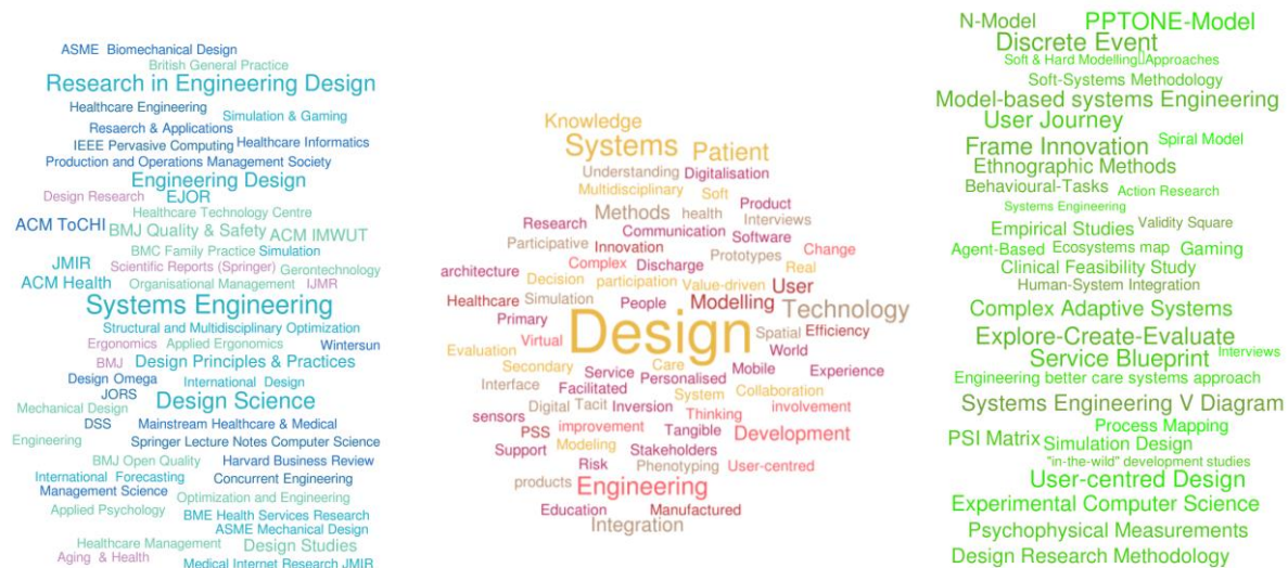
Figure 1. Questionnaire answers with disciplinary target journals (left), keywords describing research practice (centre) and research methodologies/frameworks used (right)