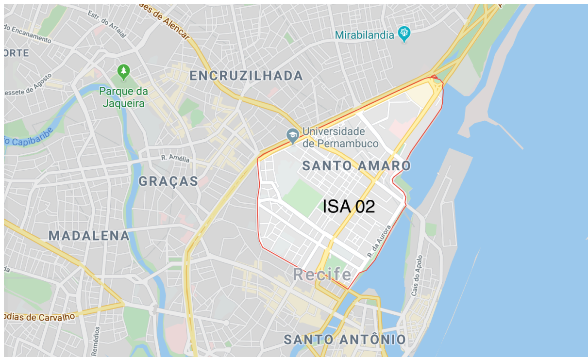
Figure 2: Integration Security Area 02

This ISA belongs to the city of Recife and is responsible for the conglomerate of three neighborhoods: Santo Amaro, Boa Vista and Soledade. In Recife, these neighborhoods represent a high crime rate considering the CVLI and CVP data of the state of Pernambuco.