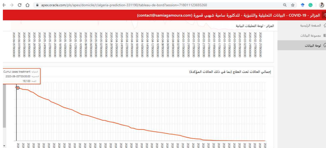
Figure 2. The cumulated cases under treatment (with our statistical forecasting)

Currently I am working to generalize this web application to include all the countries.