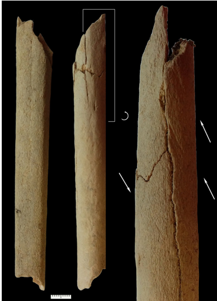
FIG5. Cutmarked vulture ulna from the Abri Cellier (CL14 -US 104- Y24- 1) (R. White's excavations), scale represents 1cm, with 1 mm division identified. CAD: V. Laroulandie, CNRS.