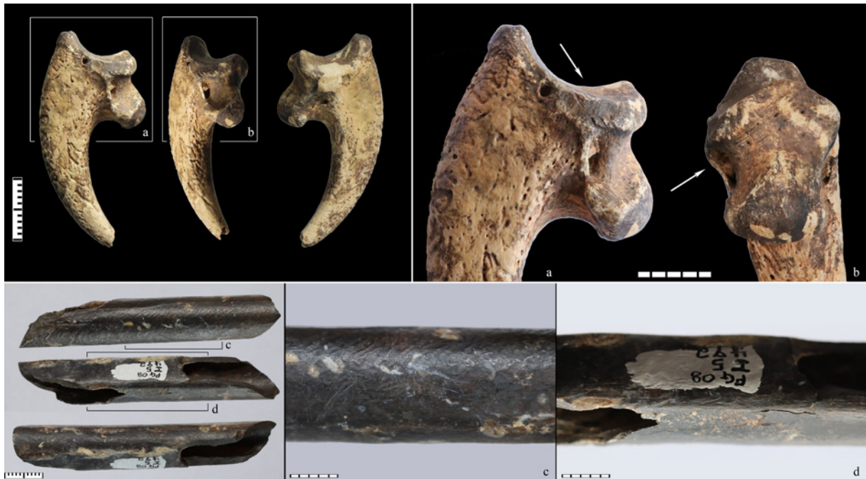
FIG4. Cutmarked bearded vulture bones from le Piage (J.-G. Bordes and F. Le Brun-Ricalens' excavations, currently stored in PACEA's facilities). Top: right first talon (PG12-15D b8-1903); lateral, plantar and medial views; "a" and "b" show the location and an enlarged view of the cutmarks. Bottom: left ulna (PG08-15C b4-492); "c" and "d" show the location and an enlarged view of the cutmarks. Scales represent 1 cm or 5 mm with 1 mm division identified. Photo. and CAD: V. Laroulandie, CNRS.