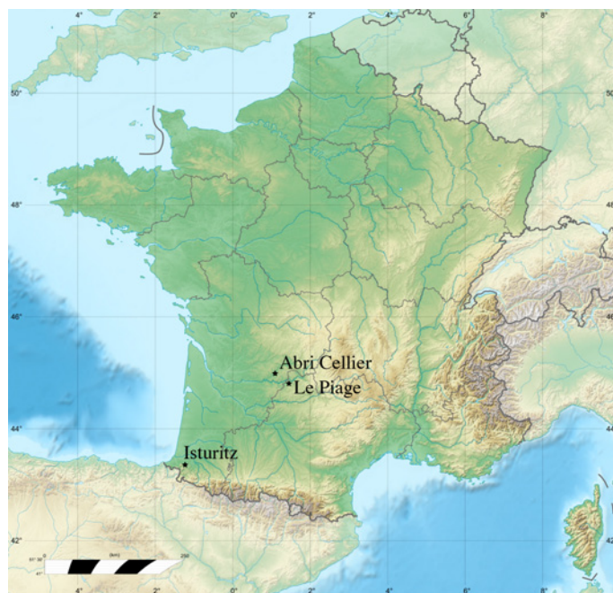
FIG1. Location of the sites (Map from Eric Gaba – Wikimedia Commons user: Sting ; CC BY-SA 4.0).

The bird remains analyzed in our study come from Isturitz, Le Piage and the Abri Cellier (fig. 1). All three sites are located in the Aquitaine Basin of Southwestern France and have recently been—or are currently being—excavated, which allows for improved stratigraphic control over earlier excavations. The sediment was systematically water-sieved at these sites, which enhances the recovery of small archaeological remains. The bird bones discussed below were all isolated during the archeozoological analysis of the faunal material. The remains were identified using the reference collections of the Université de Bordeaux (PACEA laboratory) and the Muséum national d’Histoire naturelle in Paris. Bone surfaces were inspected under a magnifying glass (30x for Abri Cellier) and a binocular microscope (magnification 10–30x for the other two sites) for marks and other taphonomic information (Laroulandie, 2000). Anthropogenic marks were interpreted in economic terms with the aid of experimental datasets (Laroulandie, 2000, 2001; Laroulandie et al., 2008; Pedergrana and Blasco, 2016; Romandini et al., 2014, 2016). The anatomical nomenclature follows Livezey and Zusi (2006).