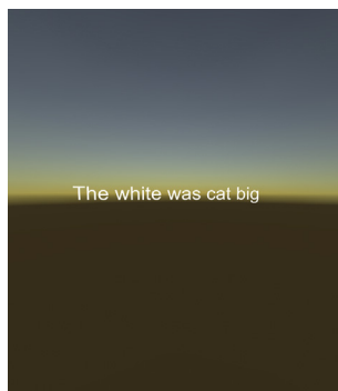
Fig. 1. Illustration of a sequence of words in the virtual reality environment. It is important to note that the word sequence remained in the same position in the virtual reality set-up independently of eye and head movements, as it would in a real-life setting.

We recorded both gamepad responses and eye-tracking measures. Concerning the behavioral response measures, we recorded error rates and the response times (RTs) in the grammatical decision task. Concerning the eye-tracking measures, we computed fixation durations and fixation probabilities (within-word re-fixations and skipping rate). All participants performed with accuracy greater than 85%. None were