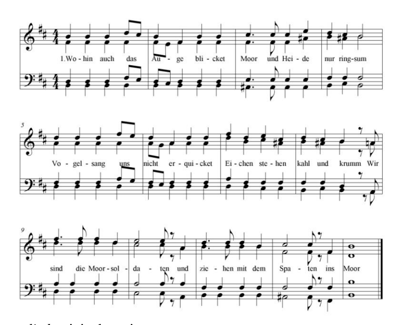
Fig. 1 Das Börgermoorlied, original version

"So I was secretly put in the infirmary so I could put my melody on paper. It wasn't easy because some prisoners, who were tasked with painting the building, worked from morning to night while whistling and singing [under SS compulsion]. In three days the music was composed, and the separate voices were transcribed on paper."<sup>17</sup>