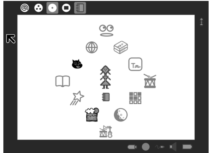
Figure 1. Prototypes of tools developed for the Nasa people: Cut pwese'je (left) and an adaptation of the Sugar learning environment (right)