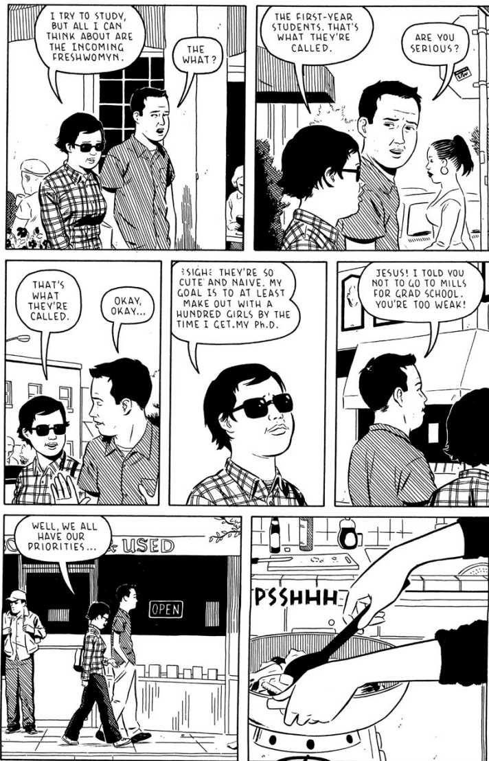
Tomine, A. (2007) Shortcomings (London: Faber and Faber, 17)

However, this discontinuity does not coincide with the page break.