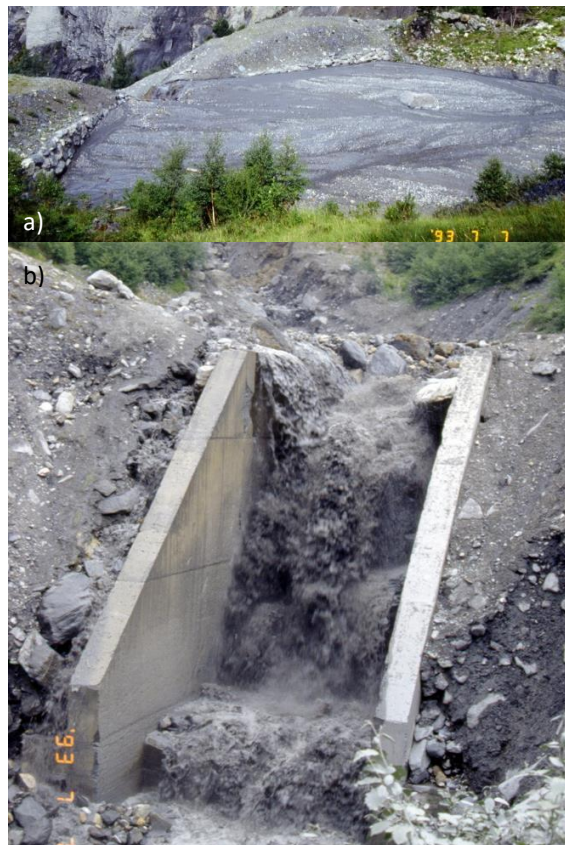
Fig. 3: Second debris flow event of July 7 th 1993: a) upstream view of the basin filled up the crest and b) downstream view of the slit jammed boulders. Note the evidences of overtopping and the related marginal erosion.

Five days later, on Jul. 7 th , new debris flows occurred. This time a huge boulder (volume 104 m 3 ) jammed the slit and the basin was completely filled (Fig. 3). This was again considered satisfactory because such a boulder would likely have damaged the downstream lined channel and the canal bridge, or might have obstructed them.