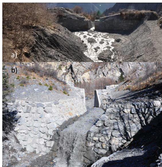
Fig. 5: Structure in 2020 with wings, lined channel and counter dam: a) upstream view and b) downstream view