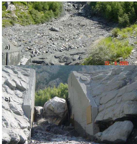
Fig. 4: Deposit after the debris flows of June, 22 nd 2005: a) bouldery deposit nearly filling the basin and b) slit nearly jammed by two large boulders

In debris flow torrents, grills set in slit dams might be damaged by huge boulders. Slits are often jammed by boulders about 1.5-2.0 times smaller than slit width. This was acknowledged in existing guidelines (Piton, 2016, p.40), which is consistent with the observations reported in this note. Using single or multiple slits with the proper width is sufficient to trap large boulders and to reduce peak discharge of debris flow surges with small boulders. In addition, single slits that are either equipped with grills or become blocking by jammed boulders will trap the bodies of debris flows, while multiple slits (so called 'debris flow breakers', Rudolf-Miklau and Suda, 2013) are more prone to trap mostly boulders and to partially self-clean the debris flow body composed of gravel and mud.