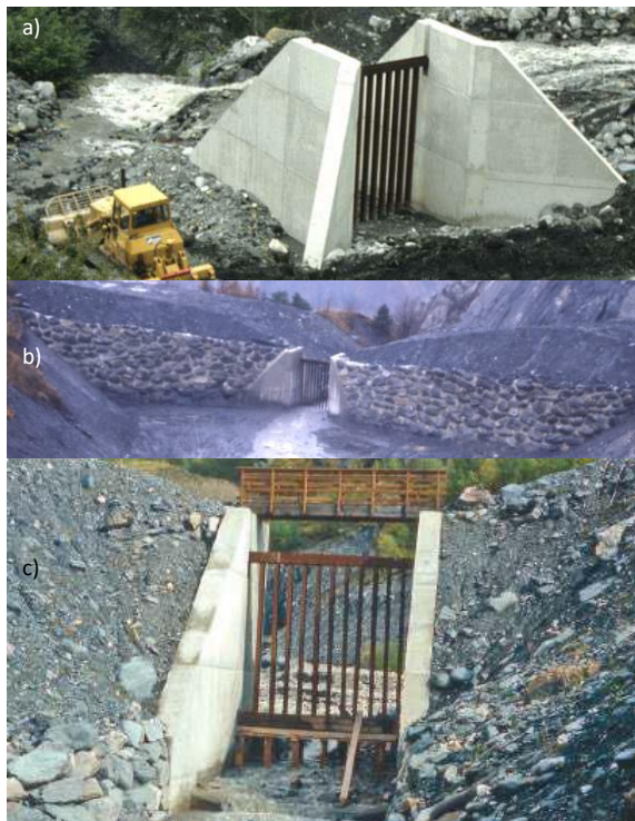
Fig. 2: The upper slit dam in its first design: a) upstream view of the slit structure in 1986; b) upstream view of the slit and side dykes protected with grouted riprap in 1987; c) downstream view zooming in on the slit and the grill. Note that the downstream face was not protected at that time against erosion during overtopping.

As soon as 1989, the chronic filling of the basin and jamming of the grills by cobbles led to the first adaptation: installing an opening at the base with a clearance of 1 m, and the installation of a horizontal beam to hold the vertical bars.