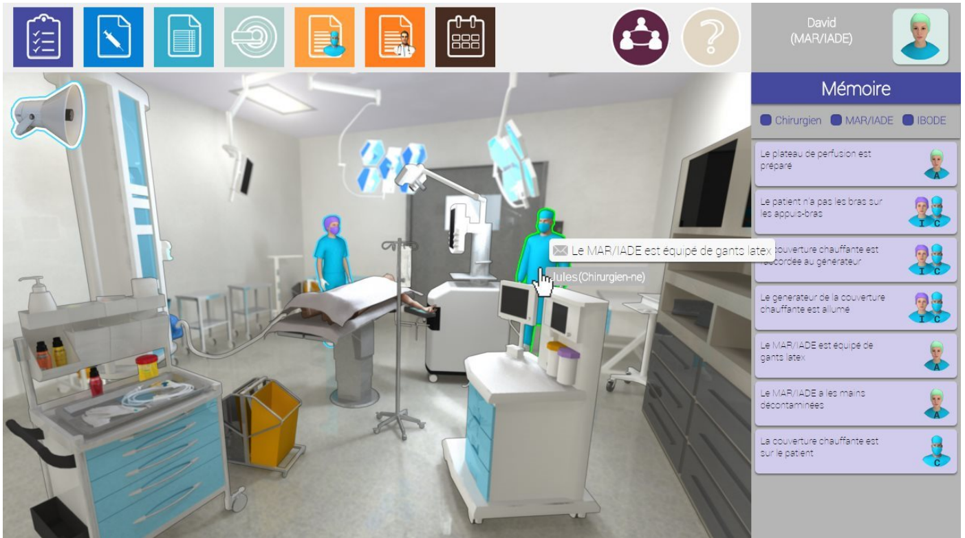
Fig. 2. This image is a screenshot from the game. The main panel is the 3D environment from the point of view of the player, including the objects, furniture and other characters. Every interactive object is highlighted when hovered and a tag with its name is displayed around the mouse cursor. The menu bar at the top contains links to open the documents (which are not spread throughout the environment for an easier access). The second to last icon on the bar can be used to trigger a vote about one among several predefined topics. The “memory” panel at the right of the screen contains every piece of information gathered by the learner. When the screenshot was captured, a piece of information was being transmitted from David the anaesthetist (the player) to Jules the surgeon. The tag says: “the anaesthetist is equipped with gloves”.

the information. That way, the game keeps a record of every information acknowledged by the player during the game session. This mechanism is essential since letting the players see and learn new information without the system knowing about it would hinder the accuracy of the debriefing.