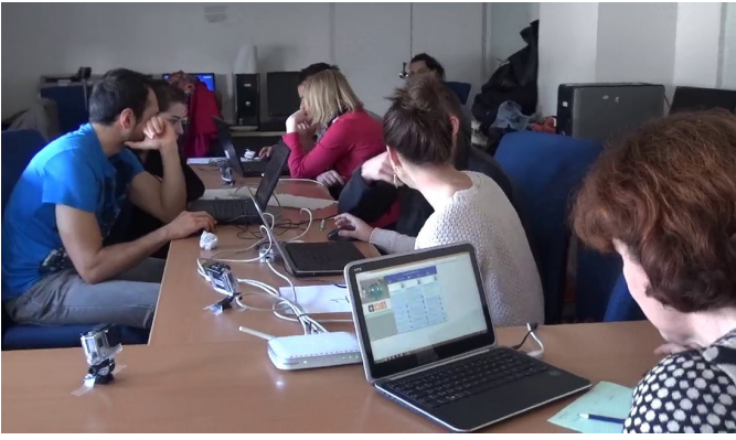
Fig. 5. Three (times two) players and the trainer take part in each session of the experimentation. While the learners are playing, the trainer supervises the game in real time and uses the supervisor's tools to take control of the session when necessary.

of the experiment were clearly stated at the beginning of each session. Oral communication was allowed within a team but forbidden outside, as only the game communication system must be used.