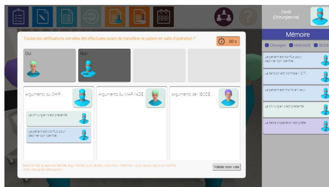
Fig. 4. The players are voting. The surgeon has a different opinion than the anaesthetist and tries to use arguments to plead their cause. The nurse has not voted yet.

have the right not to acknowledge this decision and take a counteraction. Making decisions and acting in the stead of the players is out of the scope of the vote mechanism. However, recording the arguments and the outcome in order to use these data for debriefing is clearly an added benefit of the learning game.