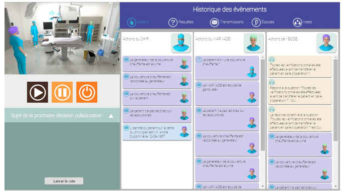
Fig. 6. The supervisor's tools are grouped in a panel where the game can be observed in real time or taken control of.

Finally, the supervisor's tools also include a debriefing panel where the objectives of the scenario are synthesised at the end of a session. The completion or failure of each objective is mentioned so that the learners are led to understand their mistakes on their own. It can also be used to support a more elaborate (i.e. at the scale of the team) analysis of the scenario in retrospect, conducted by the supervisor. The debriefing tools, the data model representing the objectives and the technical know-how used to link them to the scenario and the communication are deliberately not detailed in this article.