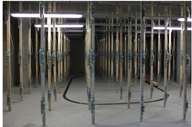
Figure 1. Our 3D WSN grid composed of 256 nodes and a mobile train.

The testbed takes into account several sources of randomness. Obviously, the radio propagation is not controlled: the multipath, shadowing, etc. will greatly affect the signal propagation. In the same way, we implemented a CSMA-CA