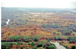
Cerro Juan Díaz LS-3