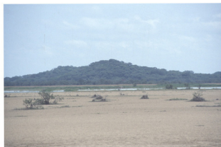
Cerro Mangote AG-1