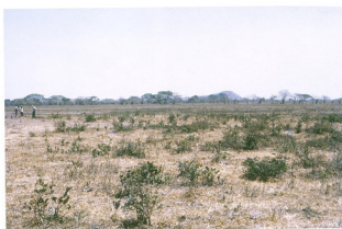
Sitio Sierra AG-3