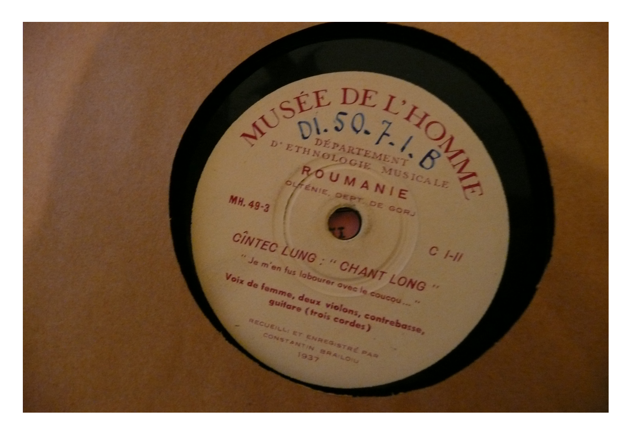
Fig. 1. A 78rpm recorded in Romania by Brăiloiu, 1937. Photo by Jean-Marc Fontaine, 2009

and Thérèse Rivière (1936). Many published records were also collected from domestic and foreign labels, such as Victor, Zonophone, His Master's Voice, Brunswick, Columbia, Parlophon, Odéon, Polydor, Pathé or Gramofono , as well as records produced at the Colonial Exhibit held in Paris in 1931. In 1937, the Musée d'ethnographie became the new Musée de l'Homme .