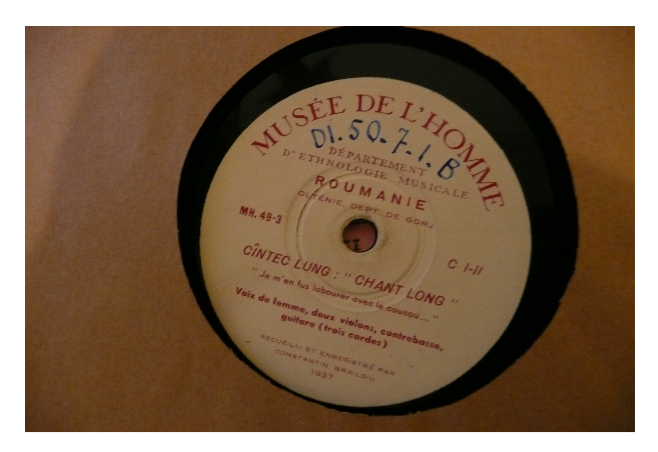
Fig. 1. A 78rpm recorded in Romania by Brăiloiu, 1937. Photo by Jean-Marc Fontaine, 2009

and Thérèse Rivière (1936). Many published records were also collected from domestic and foreign labels, such as Victor, Zonophone, His Master's Voice, Brunswick, Columbia, Parlophon, Odéon, Polydor, Pathé or Gramofono, as well as records produced at the Colonial Exhibit held in Paris in 1931. In 1937, the Musée d'ethnographie became the new Musée de l'Homme.