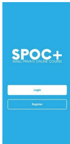
Figure 2. SPOC+ mobile interface

The website only used for the presentation of the application and our solution. The website made in PHP language with WordPress as the basic CMS. Collecting of colors and the design of our UI (User interface) were carefully considered. We chose blue for its soothing, calmness and relaxation (Singh, 2006) aspect (figure 2).