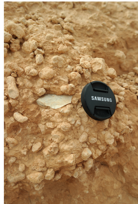
Figure 4. Stone artifact in its position found in TB-1 on a paleosol.

The original aim of the project was the reconstruction of paleoenvironmental conditions during loess sedimentation and soil formation phases. In this short communication, however, we focus on lithic artifacts found by chance during fieldwork. The chronology is still preliminary and allows only a rough temporal framework. However, our still-ongoing luminescence dating indicates that the lithic artifacts can be attributed to the marine isotope stage (MIS) 6 or older. Stone artifacts made of fine-grained flint (Fig. 3) were found on top of a paleosol in two locations (Fig. 4; for orientation see Fig. 2; TB-1 is 33.48162° N, 10.00782° E, and MT-02 is 33.51820° N, 9.99644° E). Combining both locations, the collection comprises 23 unretouched complete flakes larger than 2 cm, which are cortical, partially cortical and noncortical. We also found stone artifacts in a couple of other sections (20 complete flakes and flake fragments), albeit without exact stratigraphic context (the artifacts were washed out and transported downslope). The location of the artifacts found on paleosols is shown in Fig. 2. The age attribution has to