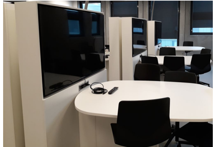
Fig. 3. Interactive poster session room