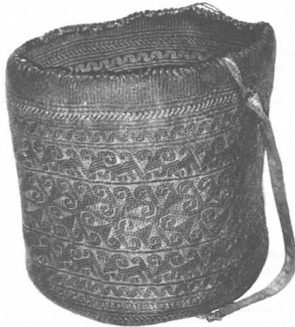
Photo 7. An old drawstring basket with rows of dog motifs (h. 35 cm); upper Mahakam river area.

underworld dragon goddess, occurs on Ngaju ritual hats as the “golden goat,” carried down to this earth by a mythological celestial ancestor (Maiullari 2011). Likewise, the motif of the squatting anthropomorphic figure with raised arms certainly does not carry the same symbolic value on a sleeping mat or ordinary basket as it does on a ritual hat or a baby carrier (Sellato 2012, 2017).