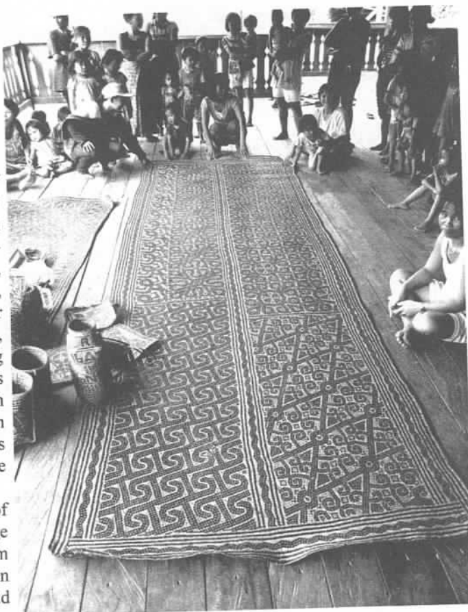
Photo 4. Long sitting mat showing separate panels with various geometric patterns; Tingalan (aka Agabag) people.

Transmission of knowledge is clearly achieved through word and gesture (see Leroi-Gourhan 1964); but, more often than not, it is based on tacit (or implicit) knowledge, i.e., observing the working procedures of others (see Sigaut 1993, Smith 2003), rather than on explicit knowledge, as an integral part of the learning process.