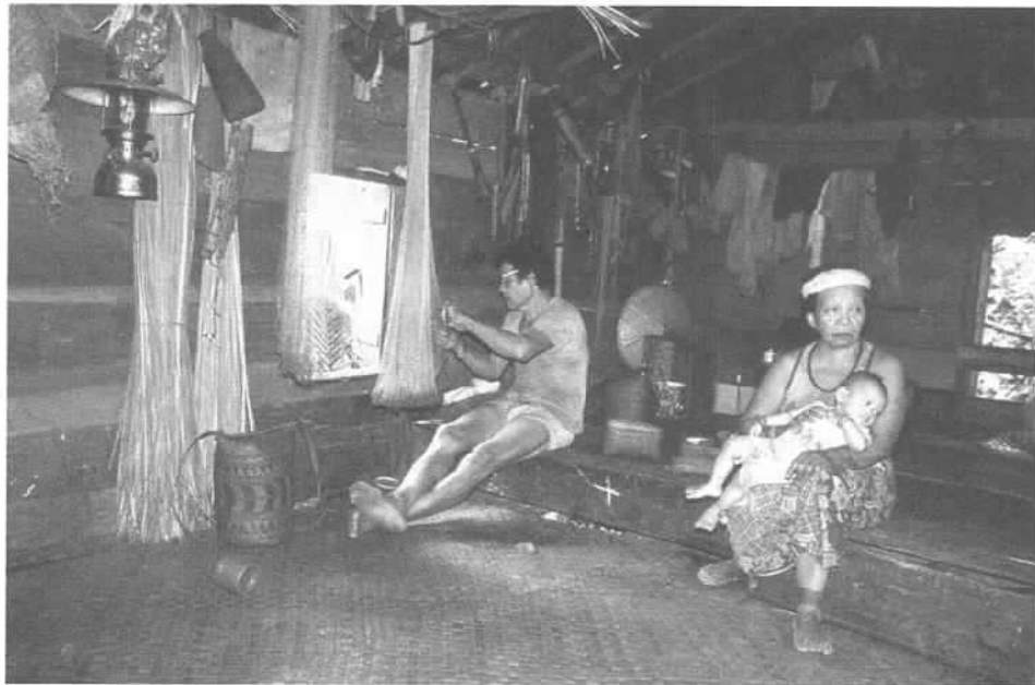
Photo 1. Inside a Dayak farmhouse; note the broad variety of plaited objects.

analogies between the arts of Borneo and those of southern China's Dian and Zhou cultures, and of Indochina (Cambodia, Dong Son culture of northern Vietnam) (Bléhaut 1997; see also McBain 1981). Borneo's cultures, and their various plaitwork traditions, later responded to influences from China, India, and Persia and, later still, beginning in the 16 th and 17 th centuries, from the Islamic and Western worlds.