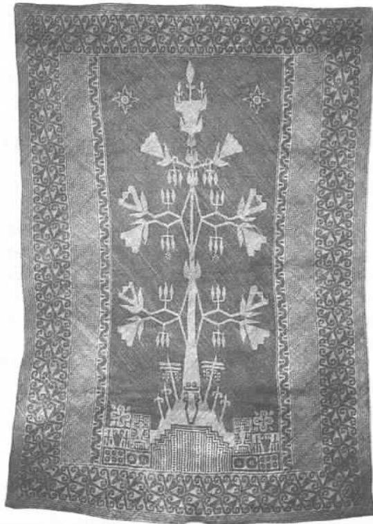
Photo 6. Ritual rattan mat with the tree of life pattern, referring to the myth of creation of the world (l. 200 cm); Ngaju people.